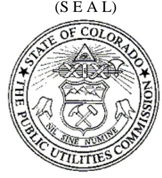
ATTEST: A TRUE COPY

WITNESS MY HAND AND THE SEAL OF THE PUBLIC UTILITIES COMMISSION of THE STATE OF COLORADO AT DENVER, COLORADO THIS 16<sup>th</sup> DAY OF FEBRUARY 2023.